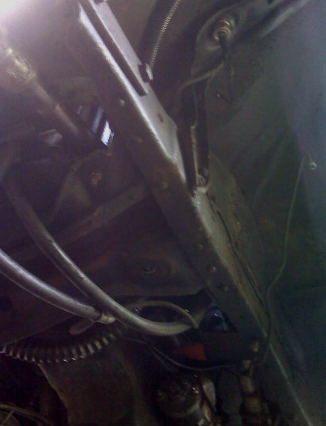
Left front rail