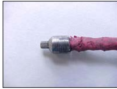
This is the tiny hex head tip of the Enrichment Stop Adjuster tool.

I didn't buy many new supplies to make this tool. I used a short section of old speedometer cable for the flex-shaft and the remains of a broken screwdriver for the handle. I also used the hex tip from a carburetor adjusting tool kit I bought for about $12. This kit is available from the Lisle Corporation under part number 55250 at CarQuest stores. It contains a flexible-shaft driver with four interchangeable heads. The adjusting tool supplied in the kit can't be used on fuel injections because the shaft is too stiff to reach the set-screws. Also, the 3/32" hex head is too long as furnished to maneuver into place. The head must be cut down to a much shorter length and then attached to a more flexible shaft such as the speedometer cable I used. This hex head is made from very tough steel. A Dremel tool or high-speed grinder must be used to cut it. A hack saw won't work. I drilled a shallow hole in the back side of the shortened head in order to securely epoxy the cable tip. Probably any type of industrial-strength epoxy will do. I used the "J-B Weld" brand I found at the auto parts store. To protect the plenum from scratches when the tool is used, I enclosed part of the cable in heat-shrink tubing.