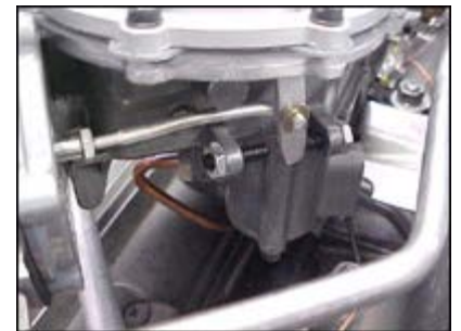
The blackened horizontal screw on the left is the Economy Stop; the screw on the right is the Power Stop.

One common misconception is that stop positions can be set on a workbench by using a vacuum gauge plumbed to the enrichment diaphragm. Actually, the only way to determine the proper stop positions is to measure the nozzle fuel pressure OR gauge the air / fuel ratio with an accurate exhaust gas analyzer. Both of these methods require the FI unit to be installed on a running engine. Once the stop positions are set, you then use a vacuum gauge to set the length of the enrichment diaphragm rod. The rod length controls when the enrichment lever travels from the economy stop to the power stop. This is similar to setting the timing of the accelerator pump shot on a carburetor.