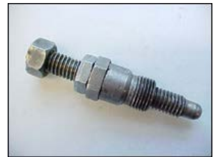
This is a Piston Stop Tool made from an old spark plug and hardware store nuts/bolts.

Confirm that the Top Dead Center mark on the harmonic balancer is properly matched to the "0" on the timing chain cover scale. Chevrolet offered high performance small block balancers with the timing mark in several different locations over the years. You can check the location of your TDC balancer mark by using a piston stop tool.