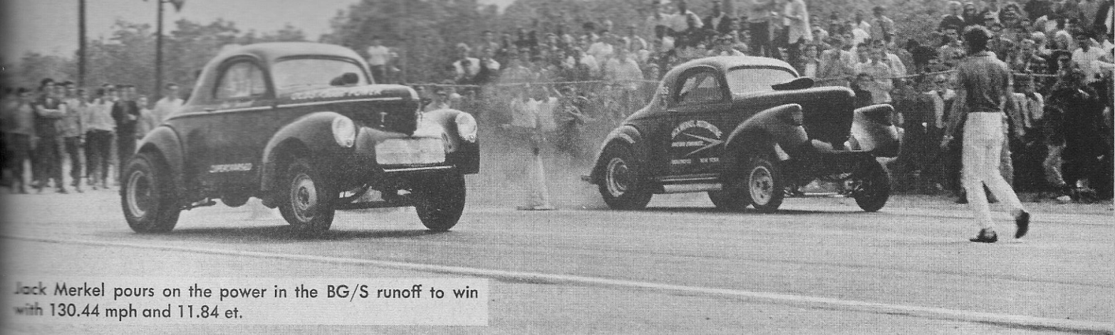
Jack Merkel pours on the power in the BG/S runoff to win with 130.44 mph and 11.84 et.