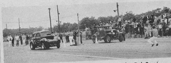
Kenny & Strong's 30 Ford pulled ahead of the Pal Service-center's Willys sedan to win B/G at 113.92 mph.